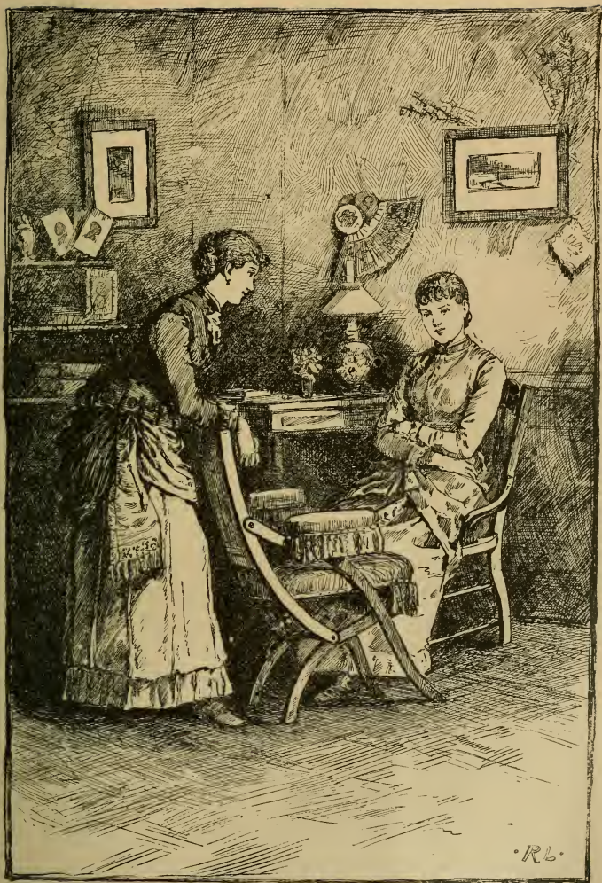
The Girls at College. — Page 50.